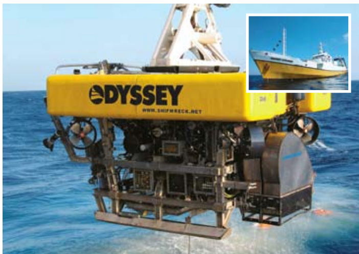
Inset: Odyssey's 251' deep-ocean archaeological platform Odyssey Explorer .