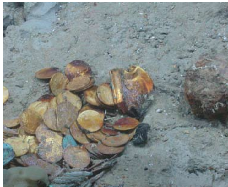
Odyssey discovered hundreds of silver coin concretions lying on the seabed at the "Black Swan" site. More than 500,000 silver coins, weighing more than 17 tons, were scattered over the site which comprised an area larger than six football fields.